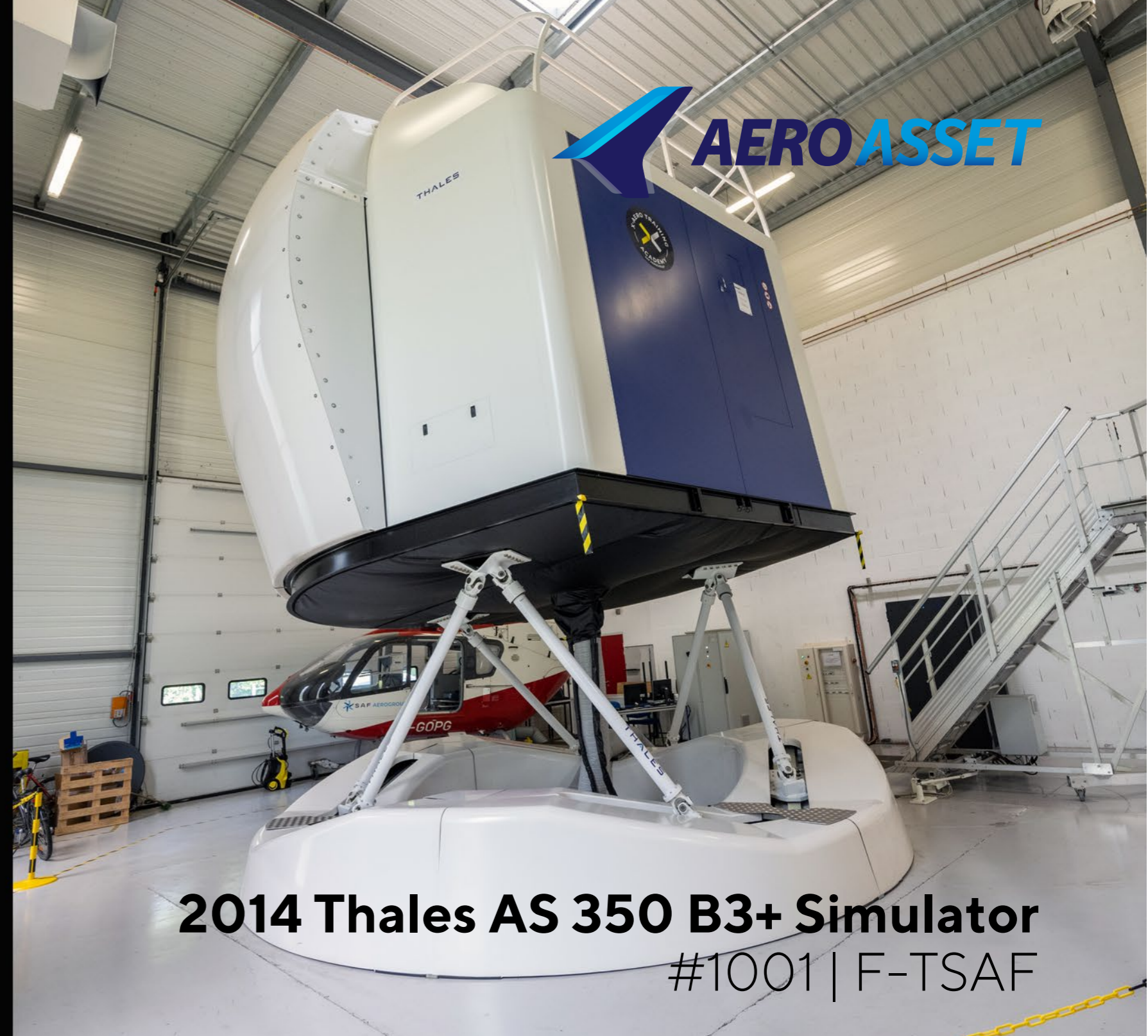
2014 Thales AS 350 B3+ Simulator #1001 | F-TSAF